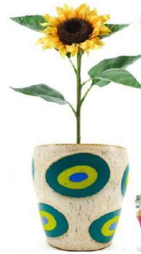
TABLE-TOP, PLANT & CAKE SALE

For information on how to book a table, please go to: https://stpetersoadby.churchsuite.com/events/kc4fcad0